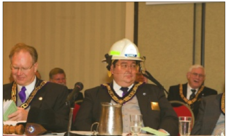
Grand Master prepares to listen to the Past Grand Master's report on his Address and year.