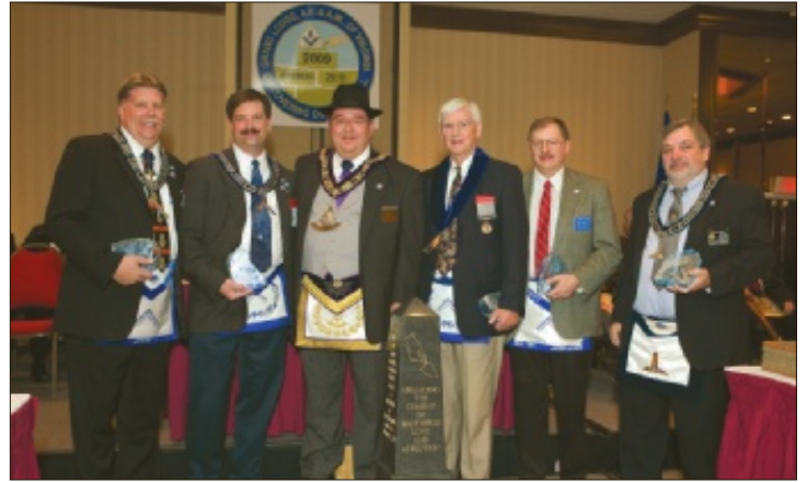
Grand Master takes a moment for a picture with the Worshipful Masters of the top five Lodges in competition for the Traveling Trowel Award.