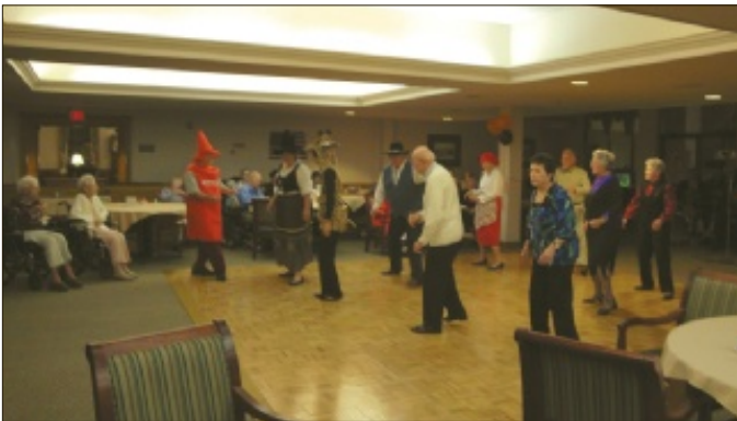
Residents dancing to the electric slide.