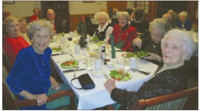
Residents enjoy the Private Dining Room.