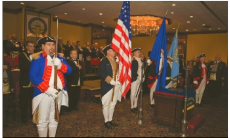
Members of the Heroes of '76, Washington Cruisers Chapter presented our Nation's colors at the opening of Grand Lodge.